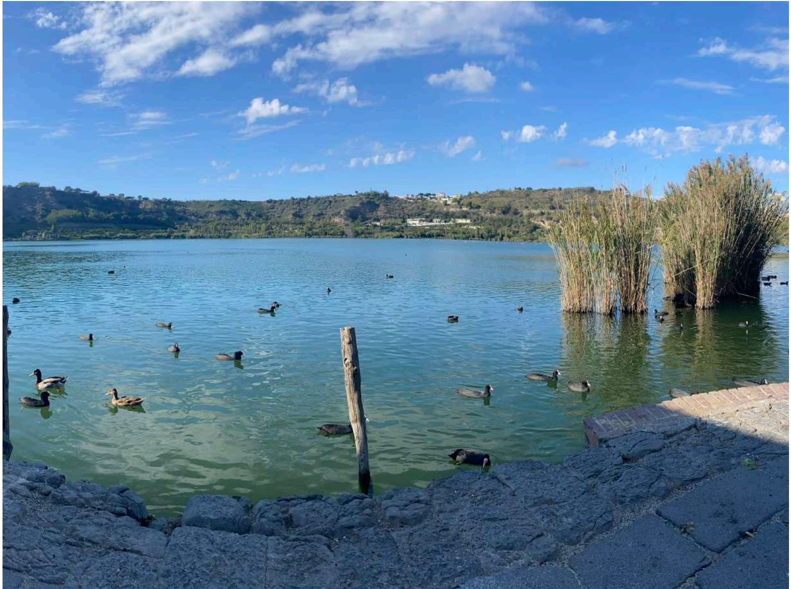
Lago di Averno