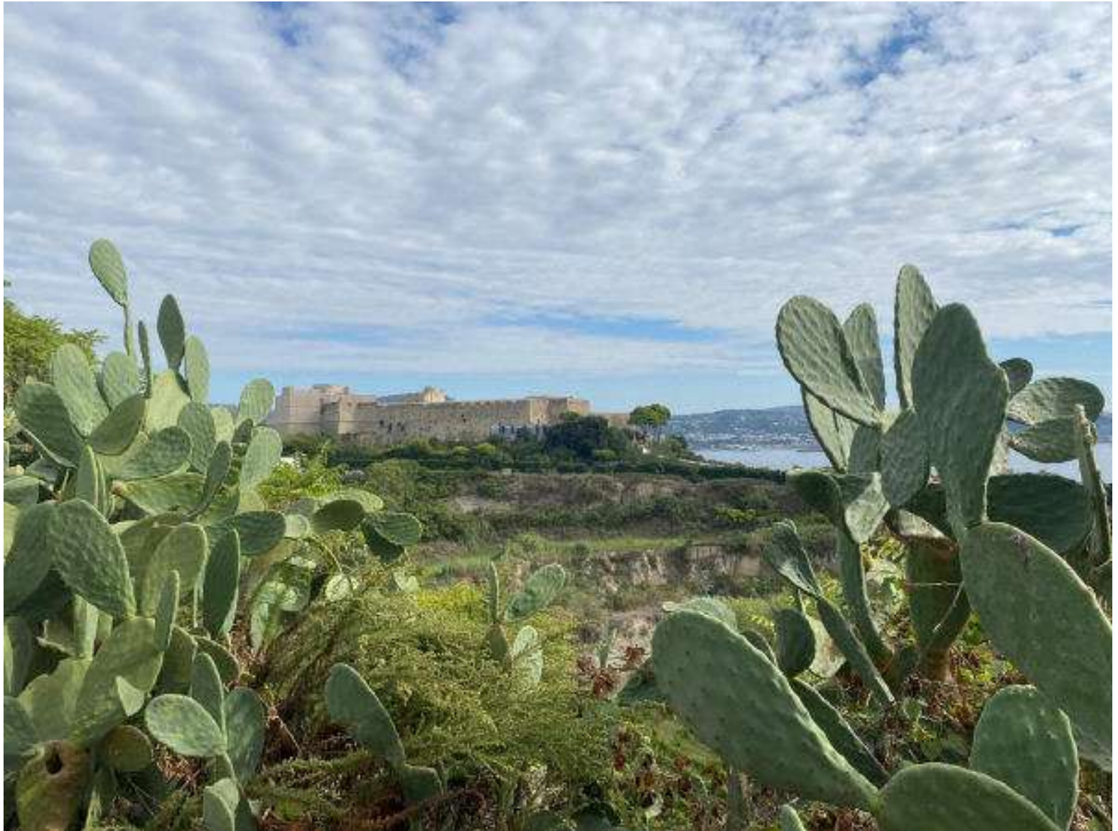
Walk to the Castle